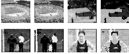
Figure 2: Examples of segmented color-blob maps.

where Width(R_j) is the width of minimum bounding rectangle (MBR) of color-blob R_j , normalized by the image width. H_{sy} is similarly defined except that Height(R_j) is normalized by the height.